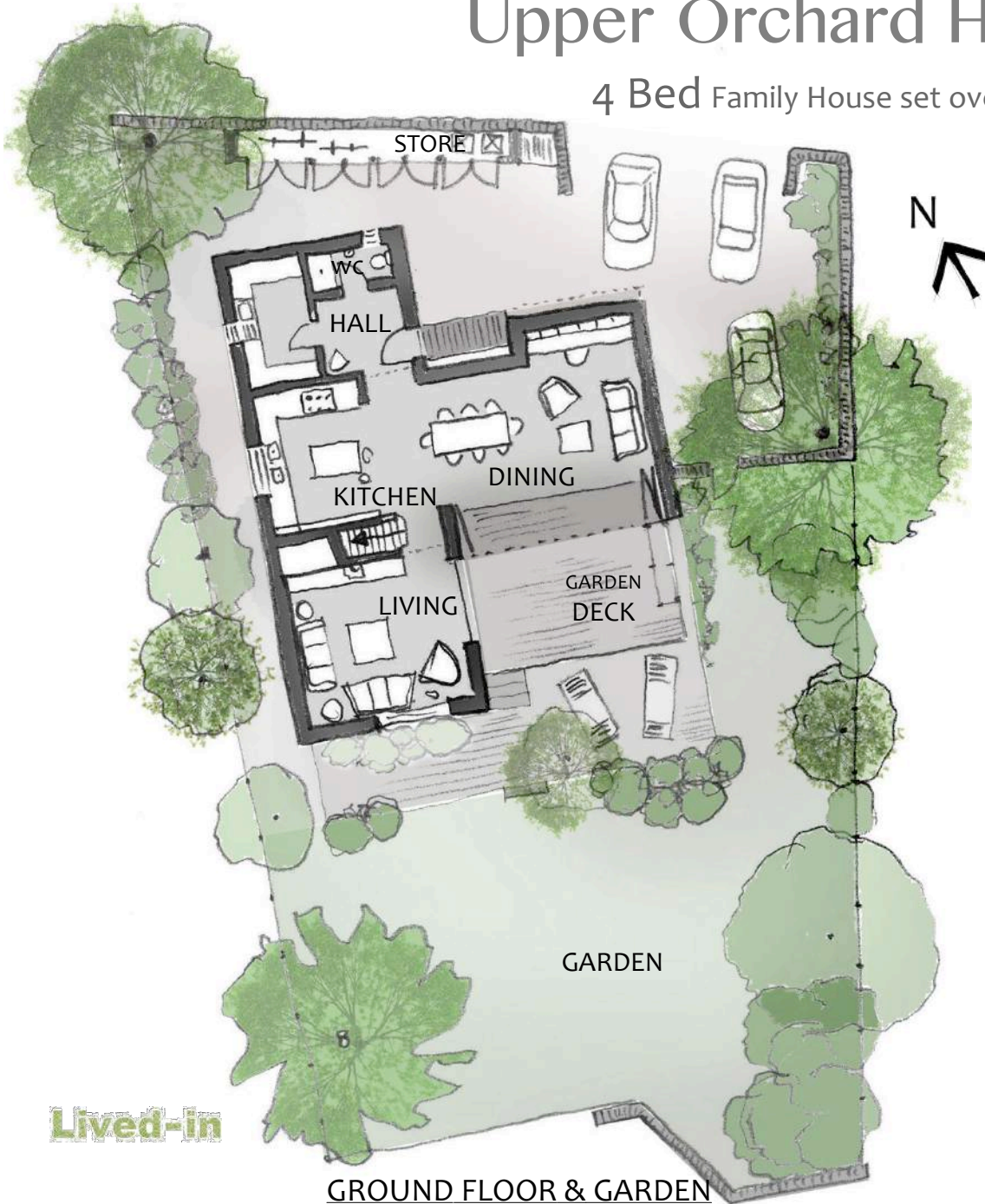
GROUND FLOOR & GARDEN